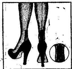
CANASTA — Heel within a heel. 51 gauge! 15 denier double outline in self color, black, brown and navy — $1.65