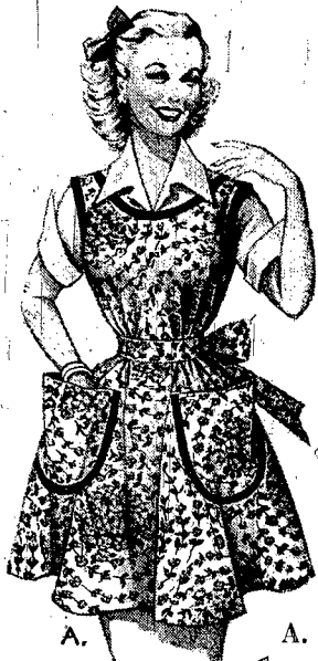
A. 198 Wear it as a Blouse, Smock, Apron

Sunrise to sunset COTTONS specially selected for MOTHER'S DAY gifts