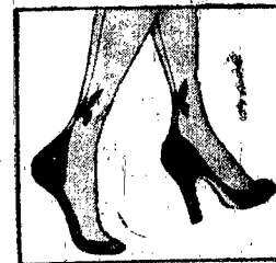
BUTTERFLY — Beautifully designed butterfly knitted in black. 51 gauge, 15 denier. $1.95