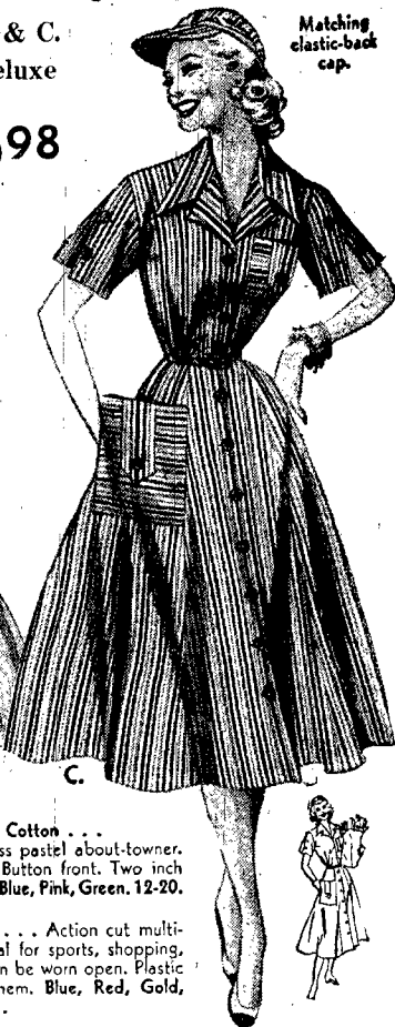
C. The Sportster... Action cut multi- color stripe casual for sports, shopping, home. Sleeves can be worn open. Plastic belt. Two inch hem. Blue, Red, Gold, 12-20; 14½-24½.