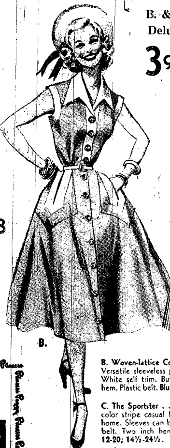
B. Woven-lattice Cotton... Versatile sleeveless pastel about-towner. White self trim. Button front. Two inch hem. Plastic belt. Blue, Pink, Green. 12-20.

Princess Peggy Princess Peggy Princess Peggy Princess Peggy Princess Come in, order by mail, or phone 56. Larson's LARSON KUHN CO.