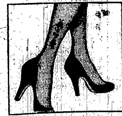
FLORAL SPRAY — A delicate handpainted floral motif, on the outside of both stockings. 51 gauge, 15 denier — $1.95

Now...you too can have "Aristocratic Ankles" with